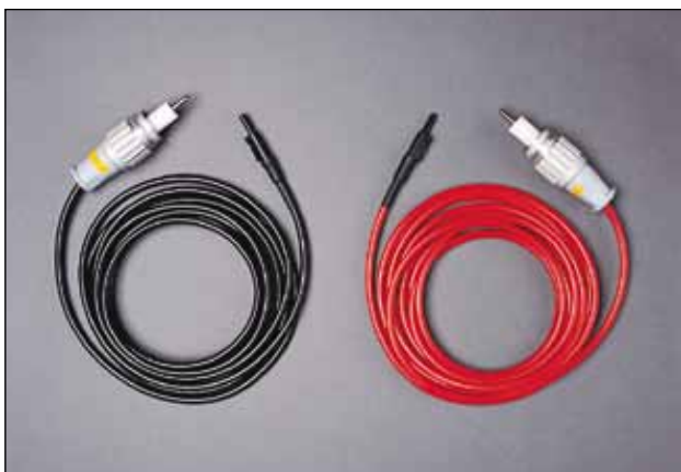
Cable set GA-00090

2) The load time and rest time for the high voltage output is calculated at the maximum output voltage and current. During an excitation test the voltage and current is only at their maximum level at the end of the test.