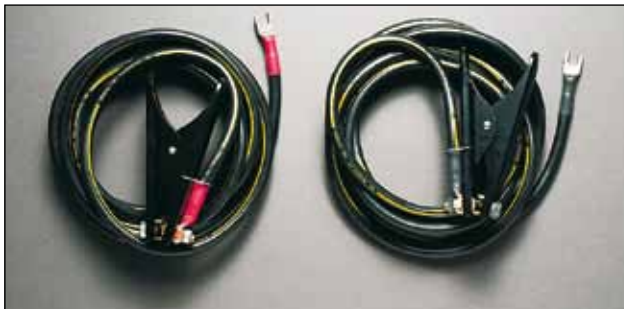
Cable set GA-05052